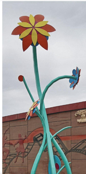
"JUBILANT" | Marsha Sharp Fwy & Ave. L