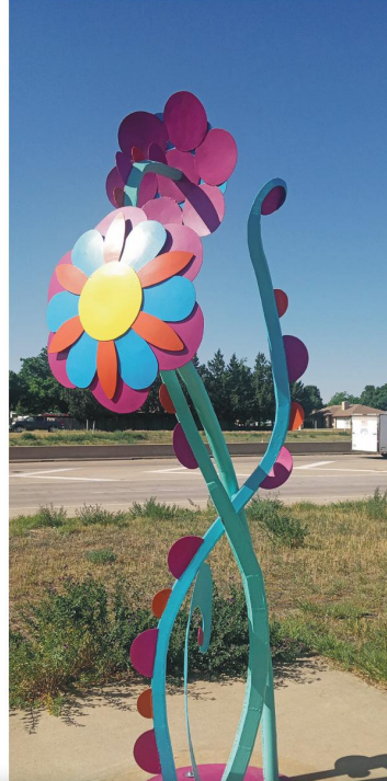
"JOLLY" | Loop 289 & Spur 327 (Outside Loop)