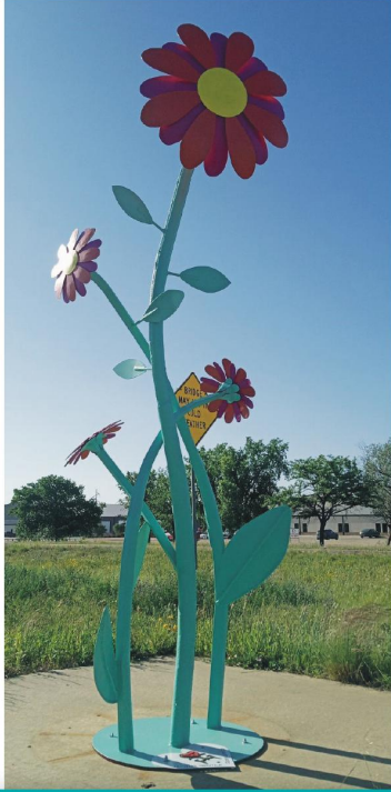
"CHEERFUL" | Loop 289 & I-27 Flyover